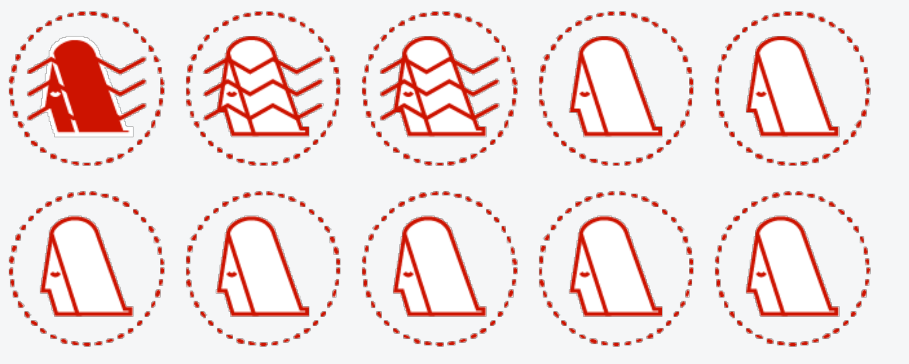
1 in 10 rape victims currently suffer from Post Traumatic Stress Disorder; 3 in 10 will develop PTSD over their lifetime.