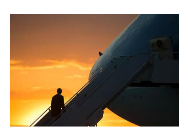
Obama Behind the Scenes