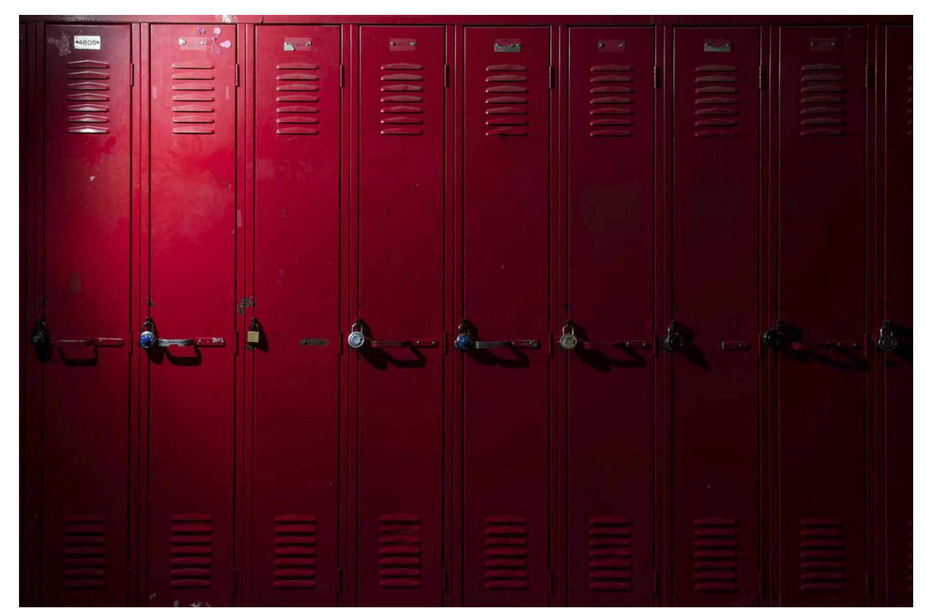
Unlike federally funded colleges, high schools are not required to report sexual assault statistics.

The issues college campuses are facing are evident in primary and secondary education as well.