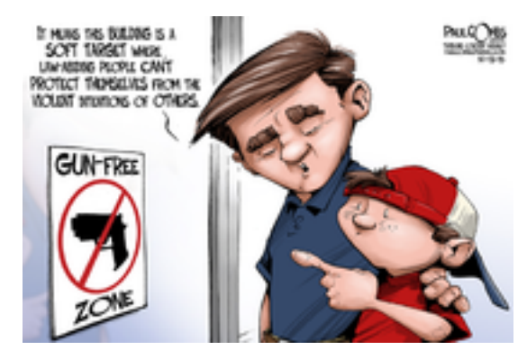
Gun Control Cartoons